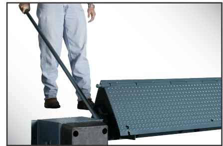
McGuire "Lift Free" lever action means no bending, lifting or pulling.