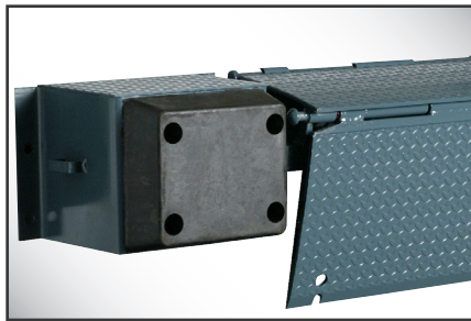
Bumper block assembly with safety tread plate-same as deck and lip.