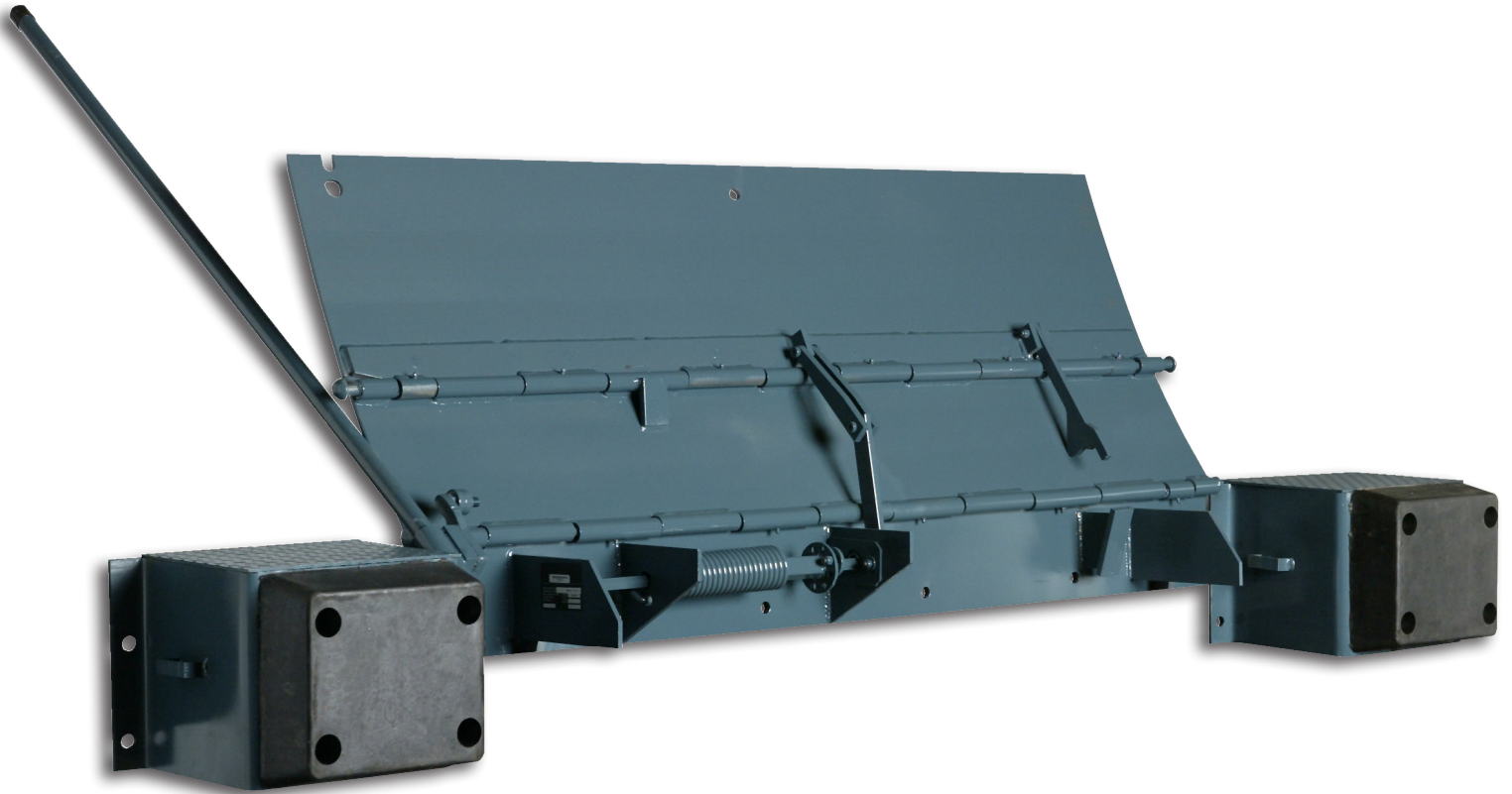
*MEDLF7220 shown with lift free lever operation and standard bumper block assembly