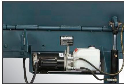
Convenient under dock mount of motor/pump with translucent reservoir for ease of maintenance