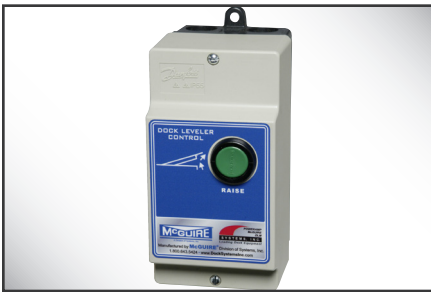
McGuire's Nema 4 control panel accepts all single and three phase voltage requirements