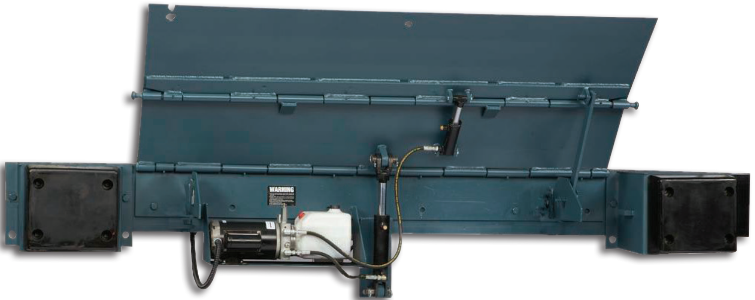
*HED7220 shown with dual cylinders