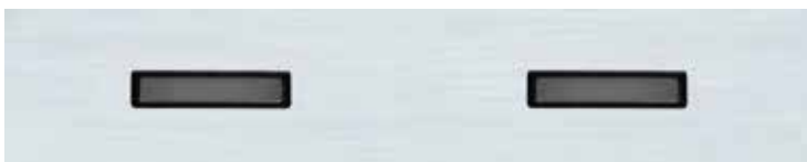
24" x 6" DOUBLE INSULATED ACRYLIC**