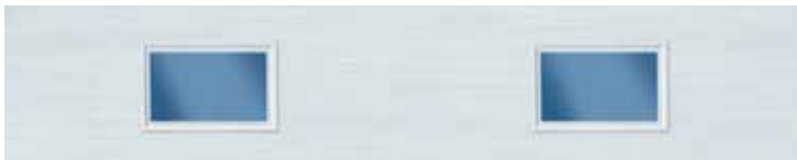
21" x 13" SHORT PANEL*