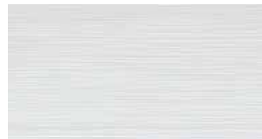
FLUSH PANEL WITH WOODGRAIN EMBOSSMENT