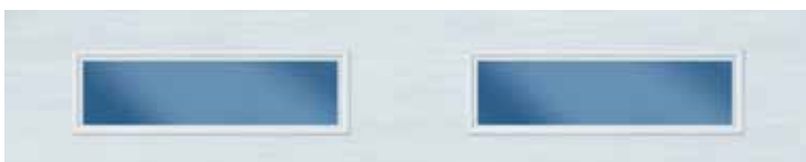
41" x 13" LONG PANEL*

*True White shown; also available in Almond, Wicker Tan, and Sandtone. Available with Clear, Obscure, or Insulated glass.